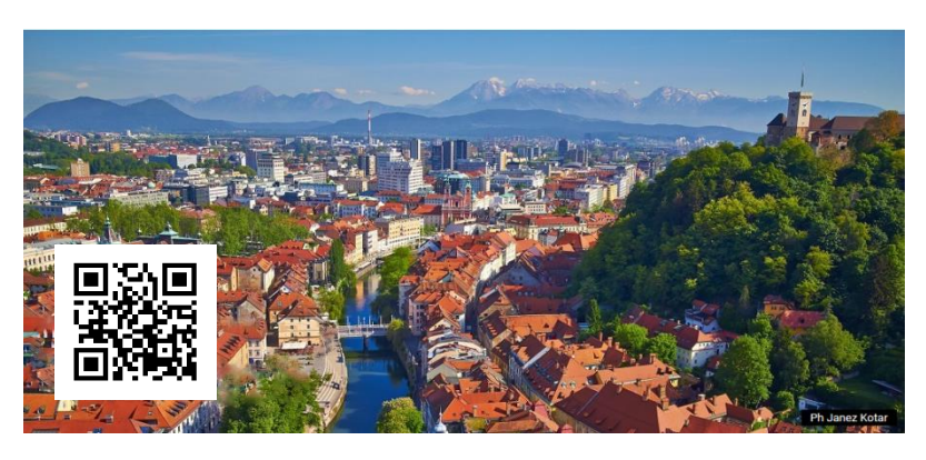
Visit Ljubljana www.visitljubljana.com