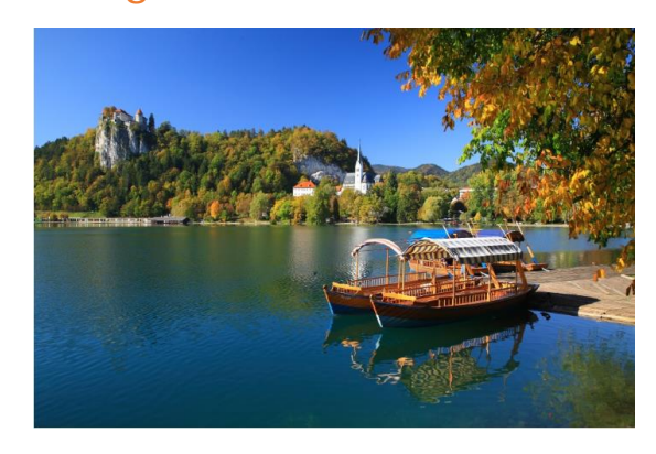
Swim, paddle, walk up to the castle